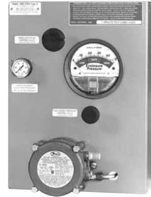
WPS/WPSA Style (With Pressure Switch)