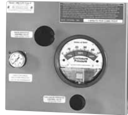
LPS Style (Less Pressure Switch)